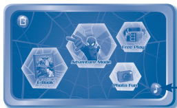
Music On/Off icon

To turn the background music on or off, touch the Music On/Off icon on the cartridge menu.